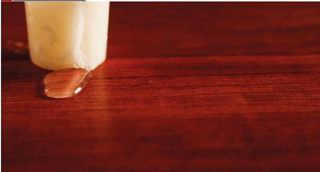
Bubinga Indoor Flooring