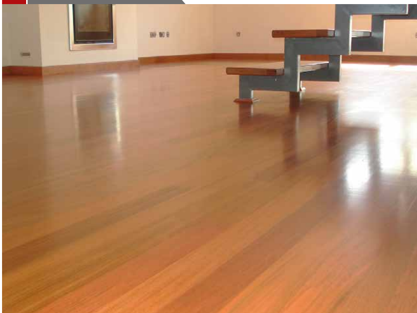
Jatoba Indoor Flooring