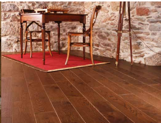
American White Oak Indoor Flooring