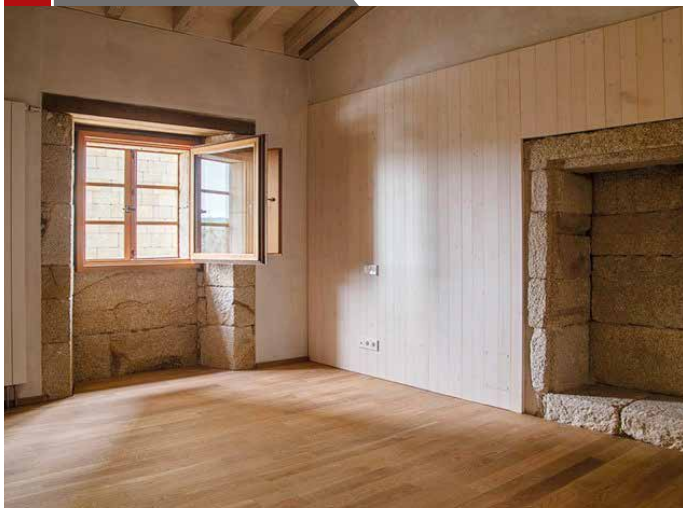
American White Oak Indoor Flooring