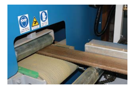
1. RUSTIC TREATMENT

A wider opening of the pores and an increase in the penetration index of the wood staining is achieved.